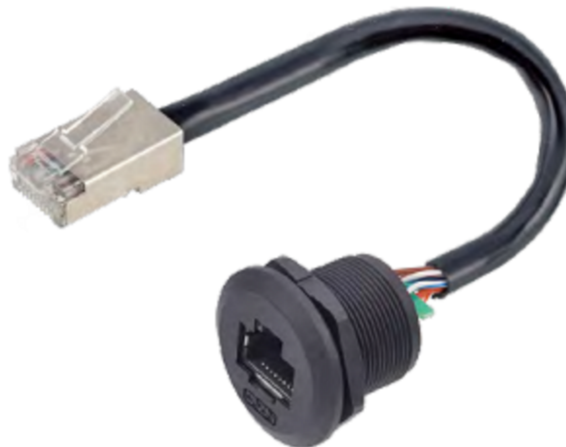
EP-RJ45面板型板前安装母插座/公直插头(无灌胶)(螺纹式) EP-RJ45 Panel front installation female socket/Male straight plug with PCB Board(Threaded)

EP - F R5 - PWF / M R5 - NCA - 1 PV - JD - PCB